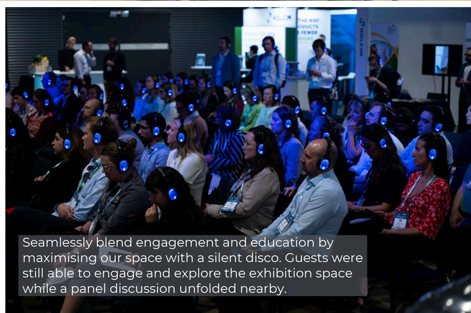
Seamlessly blend engagement and education by maximising our space with a silent disco. Guests were still able to engage and explore the exhibition space while a panel discussion unfolded nearby.