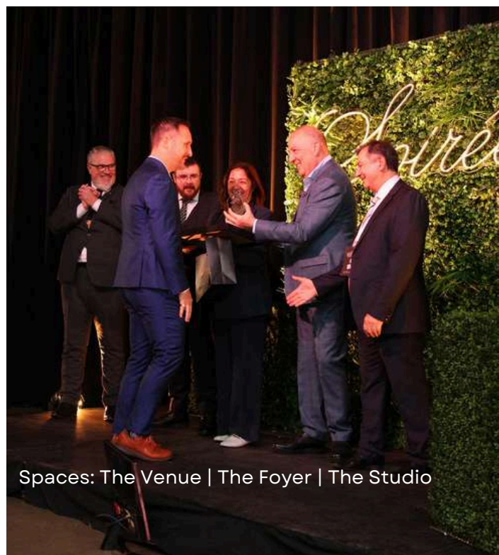
Spaces: The Venue | The Foyer | The Studio

The Annual Sydney Jewellery Industry Network Fair transformed all three of our spaces over four days creating an exhibition hall, conference environment and elegant evening soirée. A memorable celebration of the jewellery industry, the event showcased creativity, connection and craftsmanship.